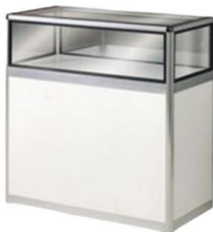
Table Jamaica - White